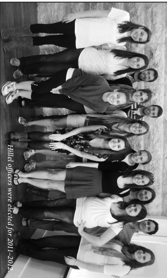
Hillel officers were elected for 2011-2012.