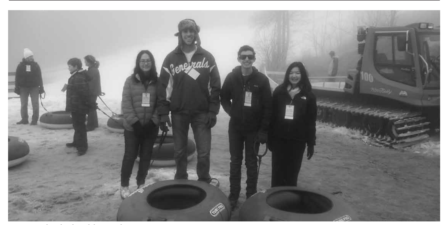
First-year students bonding while snow tubing at Wintergreen Resort.

Passover 2012 was a very exciting celebration, perhaps because it was the first service of this type that I have attended, but I find it hard to imagine that any Passover celebration is not at least moving or stirring. It is the celebration of a people's exodus from Egypt, a country in which they were oppressed by slavery and religious discrimination. During the service we ate the traditional items on the Seder plate, we recited the ten-plagues that descended upon the Egyptians, and we ate the unleavened bread just as the Israelites did when fleeing from Egypt. Attending Passover was just another confirmation to me that W&L's Hillel is a tightly-knit community that is part of a bigger world of ancient and sacred traditions that I have begun appreciate because of the welcoming arms of the groups' members.