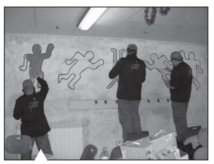
Painting a colorful mural in a bomb shelter in Northern Israel-Carly's group of 550 volunteers painted 3.5 kilometers of wall.

JNF volunteers were on call 24 hours a day to put out these fires that had the potential to destroy huge amounts of forestation. The underbrush is what fuels these fires, and our job was to clear the pruned "branches" (they were more like whole trees) to prevent a fire from spreading after a rocket hit.