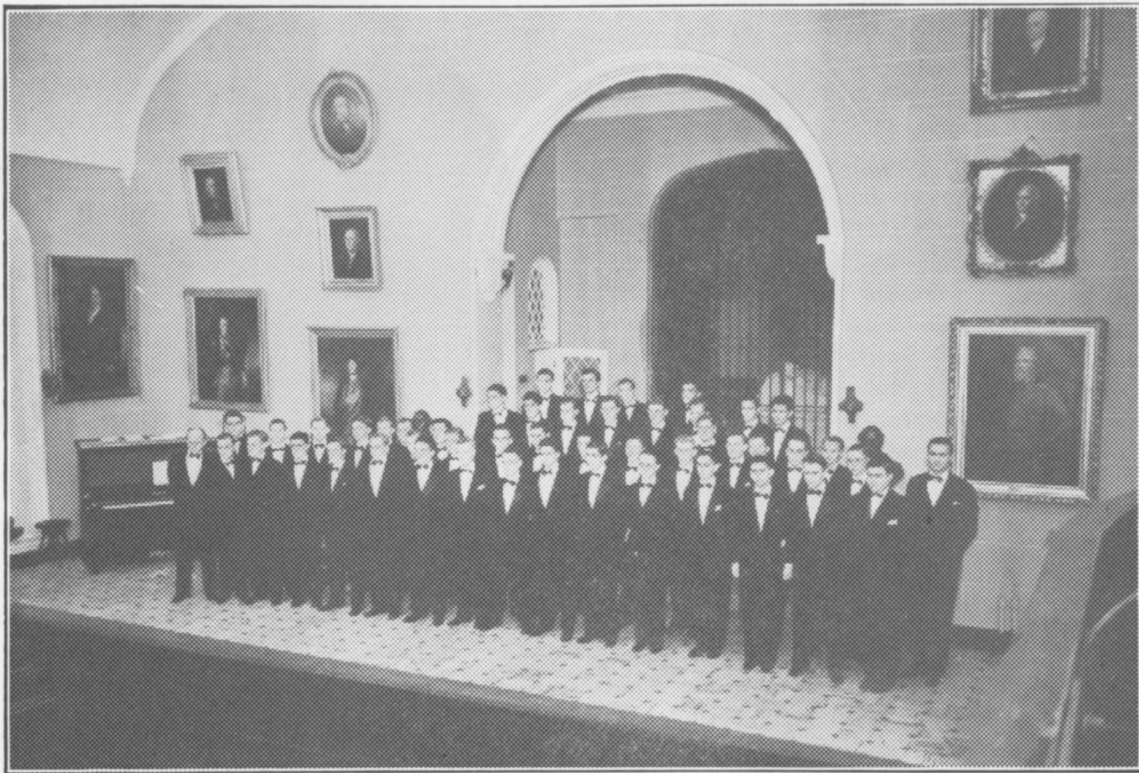
The Washington and Lee Glee Club, 1939