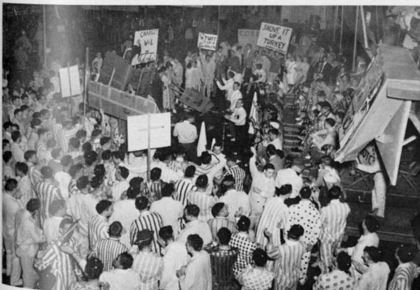
The Cheerleaders "Pep" It Up