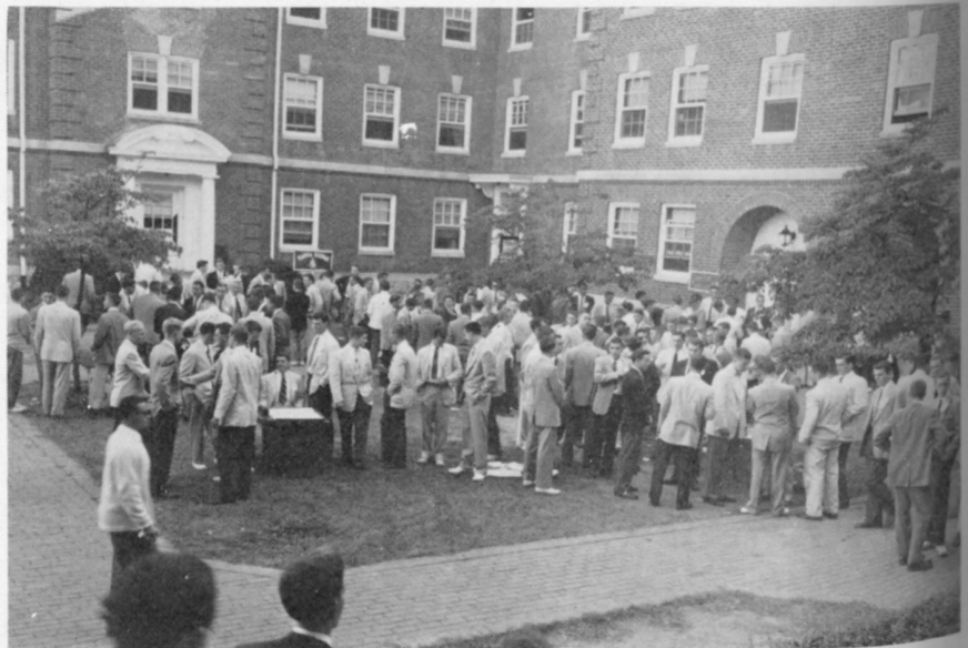
The Quadrangle is a Busy Spot During Rush Week

includes preparation for service to country as well as to career. There is no future for the young man who wastes opportunities of today