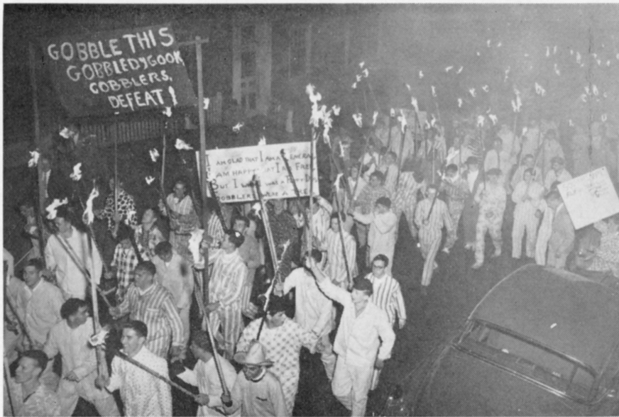
The Traditional Freshman Parade

say there is really no difference between the opening of school this year and that of any other session. The processes of youth and education are slow in changing.