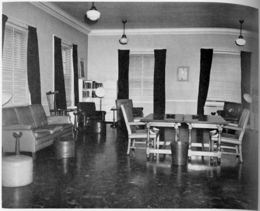
McCormick Library Browsing Room which was opened to the students on Founders Day, 1952. Furniture was donated by the Alumni Association and other accessories and equipment supplied by the Student Committee of the Friends of the Library.

Similar organizations have been perfected in several states, those in Indiana and Ohio having been