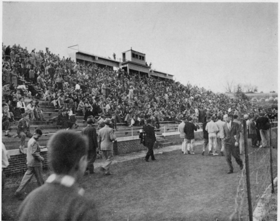
Just Before the Kick-off at Homecoming