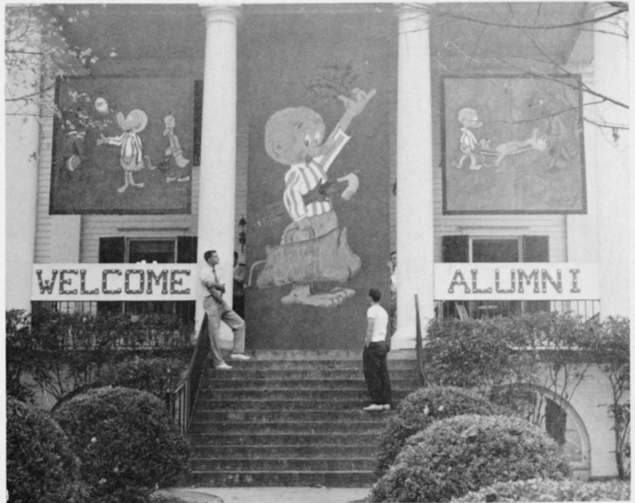
S.A.E. Goes Pogo for Homecoming

The first week of school was largely taken over by the annual "rush week." This year 86 per cent of the freshman class, 258 men, pledged the seventeen fraternities. The number tied the post war record numerically, and was only