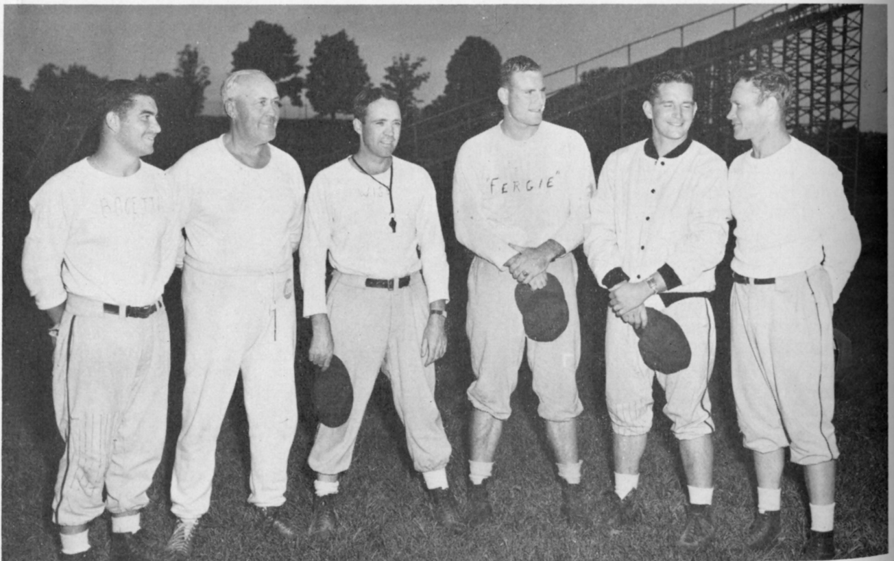
THE 1952 COACHING STAFF

The Generals play a 22-game schedule, printed on the inside cover of this issue of The Alumni Magazine .