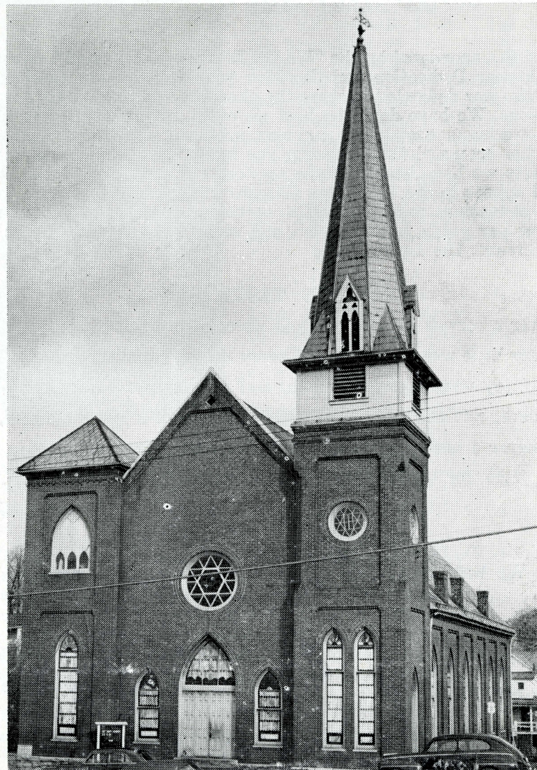
THE FIRST BAPTIST CHURCH